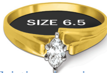
Existing ring size of 6.5